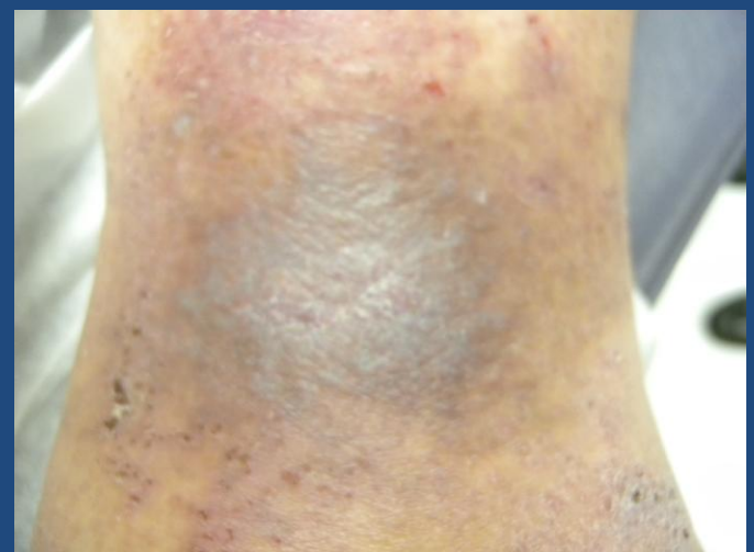
Figure 4: Follow-Up Visit