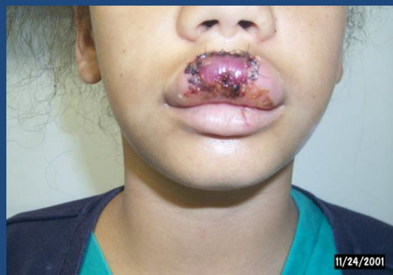
Figure 2: Treatment #4