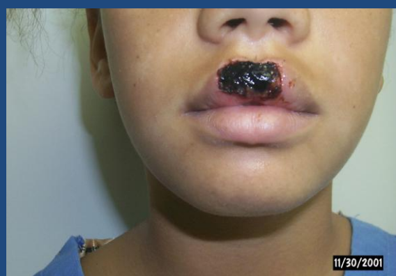
Figure 5: Treatment #10