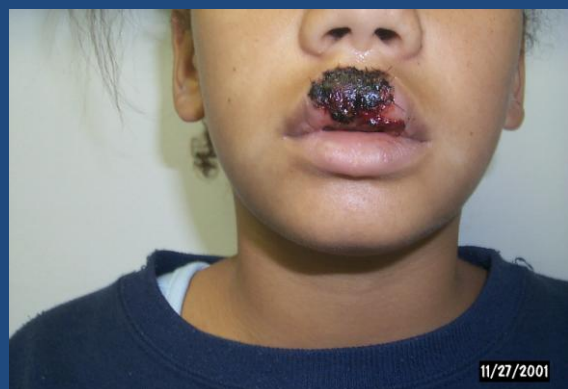
Figure 3: Treatment #7