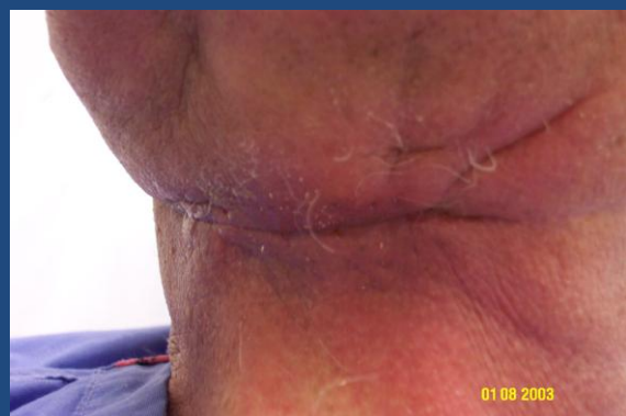
Figure 5: Treatment #42 – (#20 Post Op)