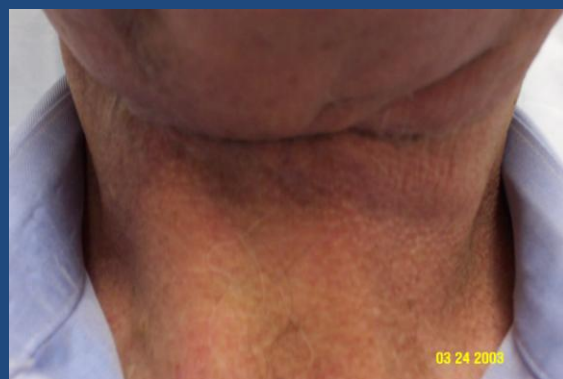
Figure 6: Follow-Up Visit - Final