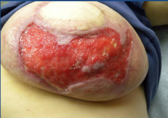
Figure 3: Treatment #27