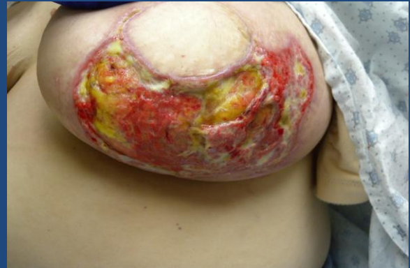
Figure 2: Treatment #7