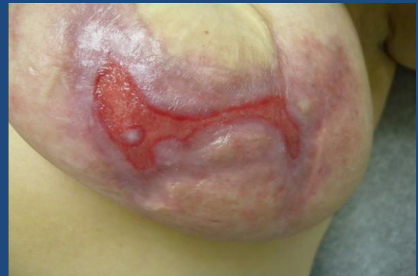
Figure 4: Treatment #38