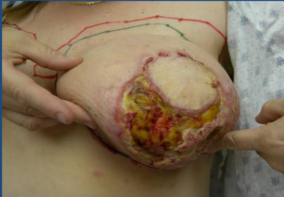
Figure 1: Initial Visit