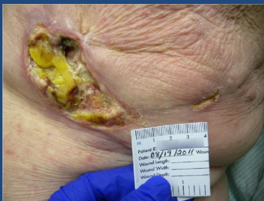
Figure 1: Initial Consult