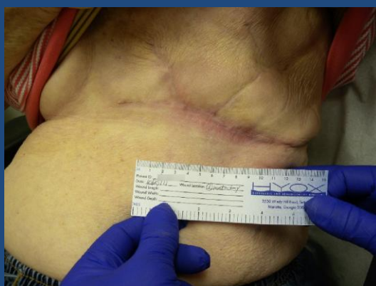
Figure 3: Follow-Up Visit