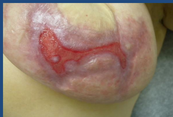
Figure 4: Treatment #38