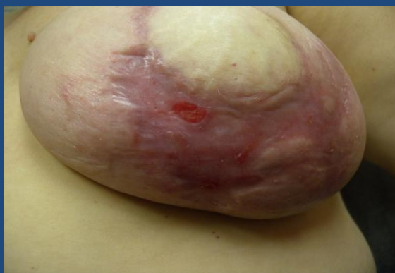
Figure 5: Treatment #45