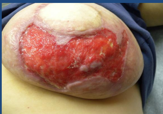
Figure 3: Treatment #27