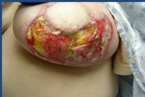
Figure 2: Treatment #7