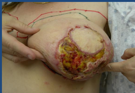
Figure 1: Initial Visit