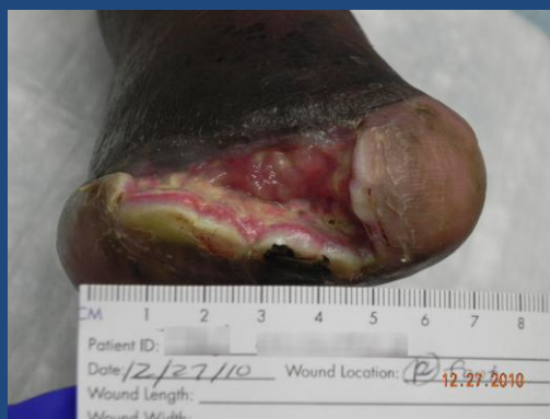
Figure 4: Treatment #34