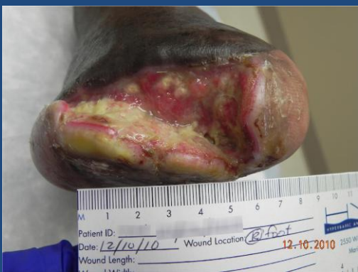
Figure 3: Treatment #25