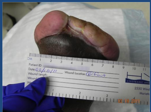
Figure 5: Treatment #60