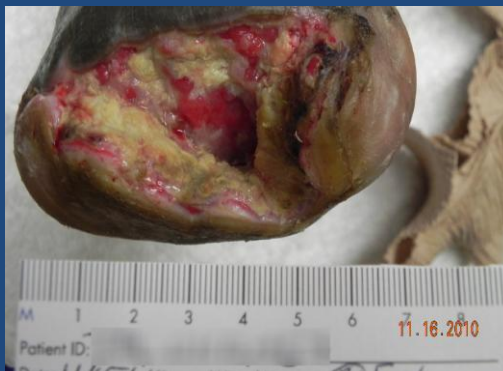
Figure 2: Treatment #8