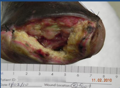
Figure 1: Initial Evaluation